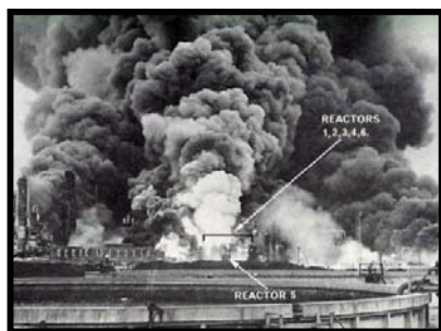
June 1974, Flixborough, England chemical plant explosion