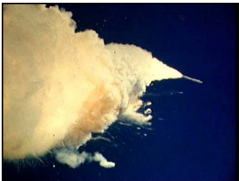
January 1986, Space Shuttle Challenger explodes during launch