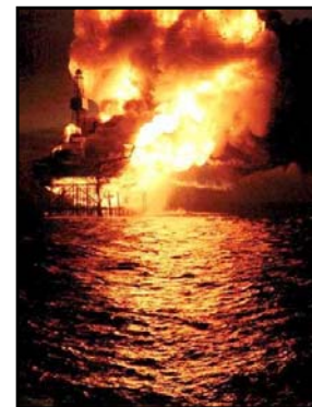
July 1988, Piper Alpha Oil Platform destroyed by fire and explosion