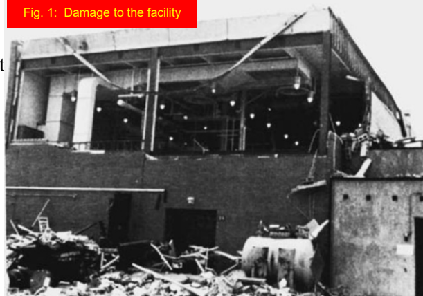
Fig. 1: Damage to the facility

[Reference: Kohlbrand, H. T., Plant/Operations Progress 10 (1), pp. 52-54 (1991).]