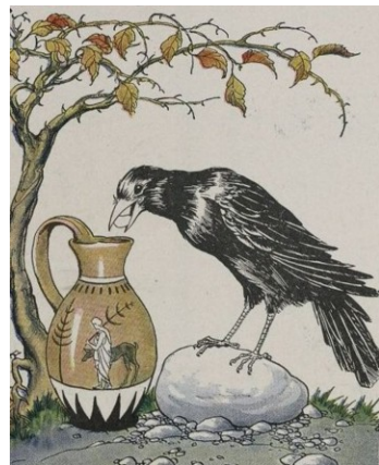
Aesop's Fable of the Raven and the Pitcher reminds us of the value of creativity.