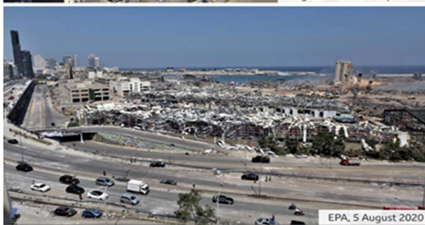
Beirut Lebanon Port area before and after the August 4, 2020 explosion

On August 4, 2020, a massive explosion occurred in Beirut, Lebanon that killed at least 160 people, injured more than 5,000 and left an estimated 300,000 people homeless*. At this time, no estimate of damages or cause of the explosion are available. The material, ammonium nitrate (AN), is a common fertilizer, but is also used as a blasting agent in mining. Approximately 2750 tonnes (3030 US tons) were stored in a warehouse for over 6 years. Local officials were aware of the material's presence and age, but insufficient efforts were made to manage the storage operation. Some ports have taken steps to limit or eliminate storage of AN in response to the Beirut explosion. (ref. Washington Post August 21, 2020)