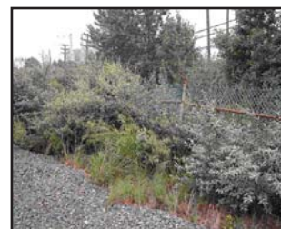
Overgrown bushes and trees obscure fences.