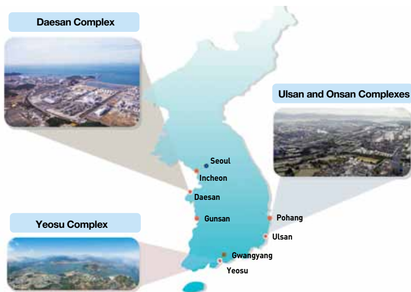
▲ Figure 2. Key chemical industry complexes were established during South Korea's government-led economic development plans, from 1966 to 1997.

world's fourth-largest producer of polysilicon. OCI plans to invest W1.8 trillion ($1.6 billion) to build an additional polysilicon plant with a capacity of 24,000 m.t./yr. OCI will then have a total manufacturing capacity of 86,000 m.t./yr, making it the largest polysilicon supplier in the world (4).