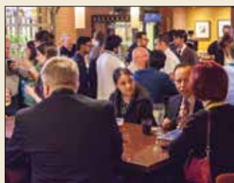
▲ Dozens of young chemical engineers gathered with Institute leaders at a networking event on Sunday, March 30.