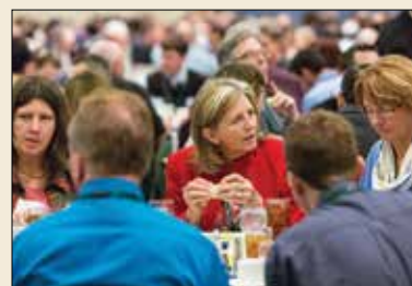
▲ A capacity crowd enjoyed an expanded Spring Meeting Networking Luncheon on March 31.