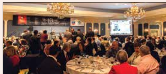
▲ On Sunday, March 30, the GCPS kicked off with a celebratory tenth anniversary banquet, where guests reflected on the past decade of accomplishments.