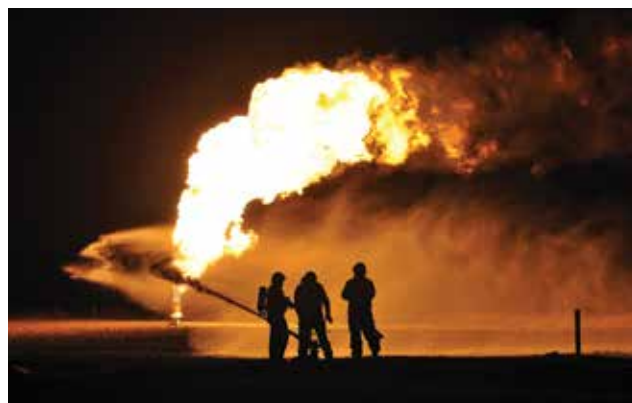
▲ Figure 1. A jet fire results from combustion of a fuel that is continuously released in a particular direction.

Pool fires are analyzed by determining the pool size and the release duration, which are then used to calculate the flame height, the duration of the burning pool, the flame temperature, and thermal radiation to external targets (6).