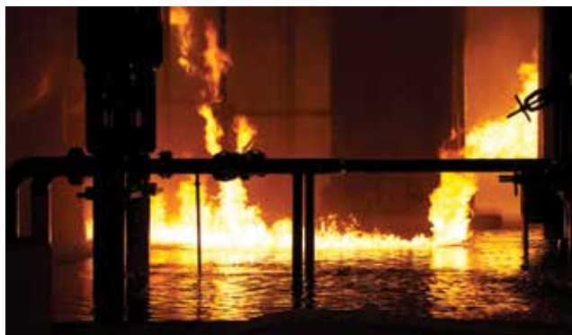
▲ Figure 2. A pool fire burns above a horizontal pool of vaporizing flammable fuel.

Modeling a range of release sizes reduces the chances that the study will overlook hazards. Different release sizes have different implications with relation to impact potential. Small and medium releases have longer durations — and a