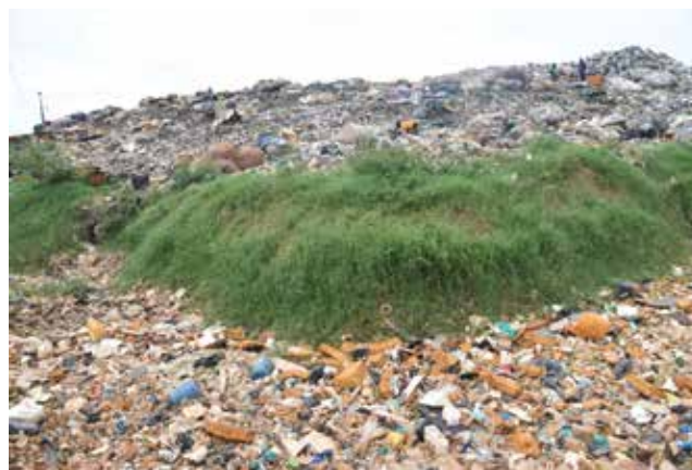
▲ Figure 3. Plastic waste accumulates at the Kiteezi Landfill in Kampala, Uganda.

Implementing a circular economy for plastics will require significant changes to the status quo. Despite their problems, plastics provide significant benefits to global sustainability, particularly in transportation, and there are no alternatives ready for immediate deployment at global