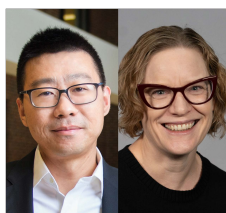
NSEF Awards Announcements