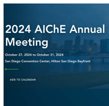
AICHE Annual Meeting Oct 27-31, 2024