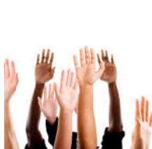
NSEF Open Leader- ship positions