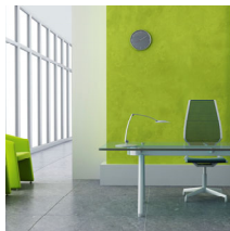
Message from the Chair