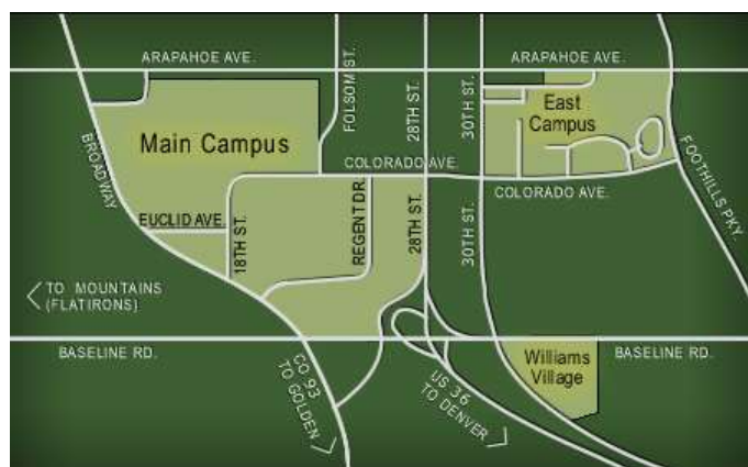
East Campus Closeup

http://www.colorado.edu/campusmap/index.cgi?bldg=BIOT