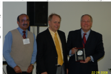
AIChE Midwest Regional Conference UIC, Chicago

http://picasaweb.google.com/ChicagoAIChE/2008AIChEMidwestRegConf?authkey=PCsxy7o3SHU