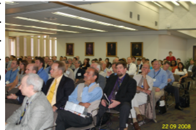
AIChE Midwest Regional Conference UIC, Chicago

In addition and most proudly, over 354 Chicago area high school students were given a "Engineering as a career choice" by the Chicago Section.