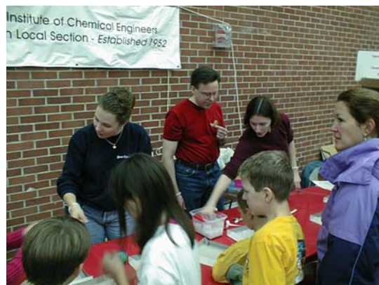
More interested children and parents.

Several parents and teachers asked for informational packets concerning the details of the experiment. The packet of information also included a description of chemical engineers and their contributions to SPF protection. Our ultraviolet beaded bracelets were so popular that we unfortunately ran out of beads at 12:30 pm (2½ hours after the science fest opened with 2 hours left to go). There were many students who were unaware of ultraviolet rays or at least were not able to explain the nature of UV radiation and its harmful effects on the skin. Overall, the experiment was a wonderful success.