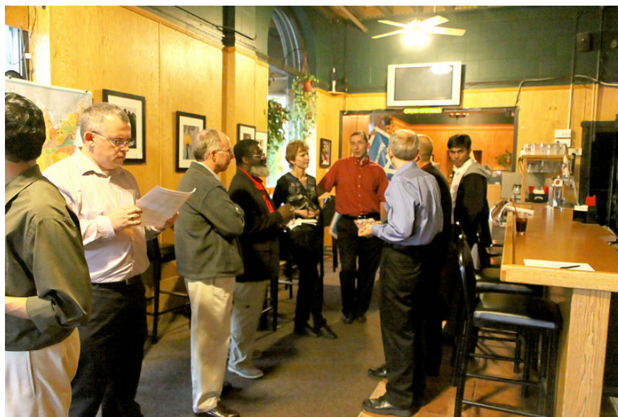
The Section’s Kick-off Meeting was held September 16 at Oscar’s Cornerstone Pub in downtown Midland. See pages 4 – 6 for additional photos.