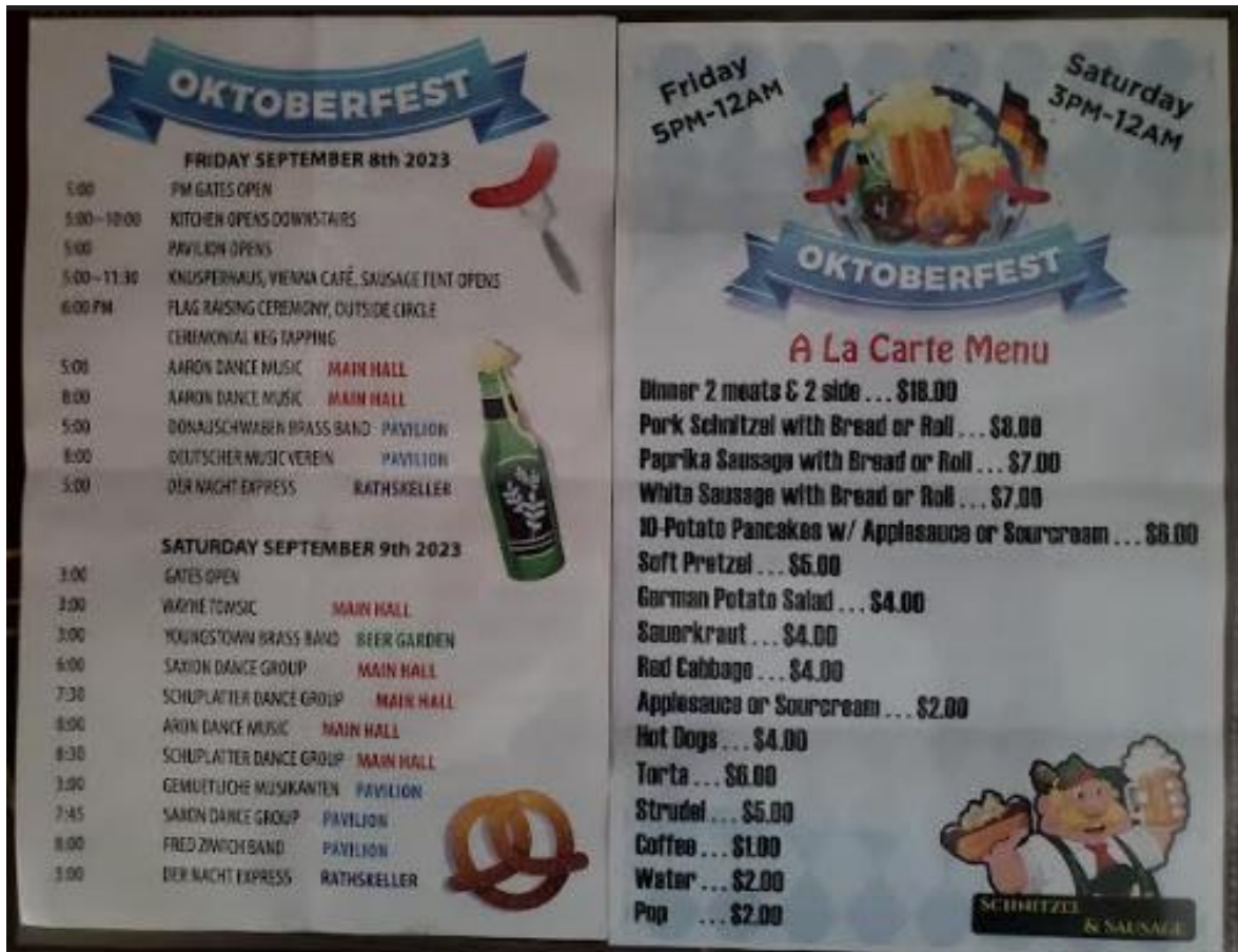
CLE AIChE Social Event: German Central Foundation Oktoberfest, Parma, Ohio Events and Dining Menu