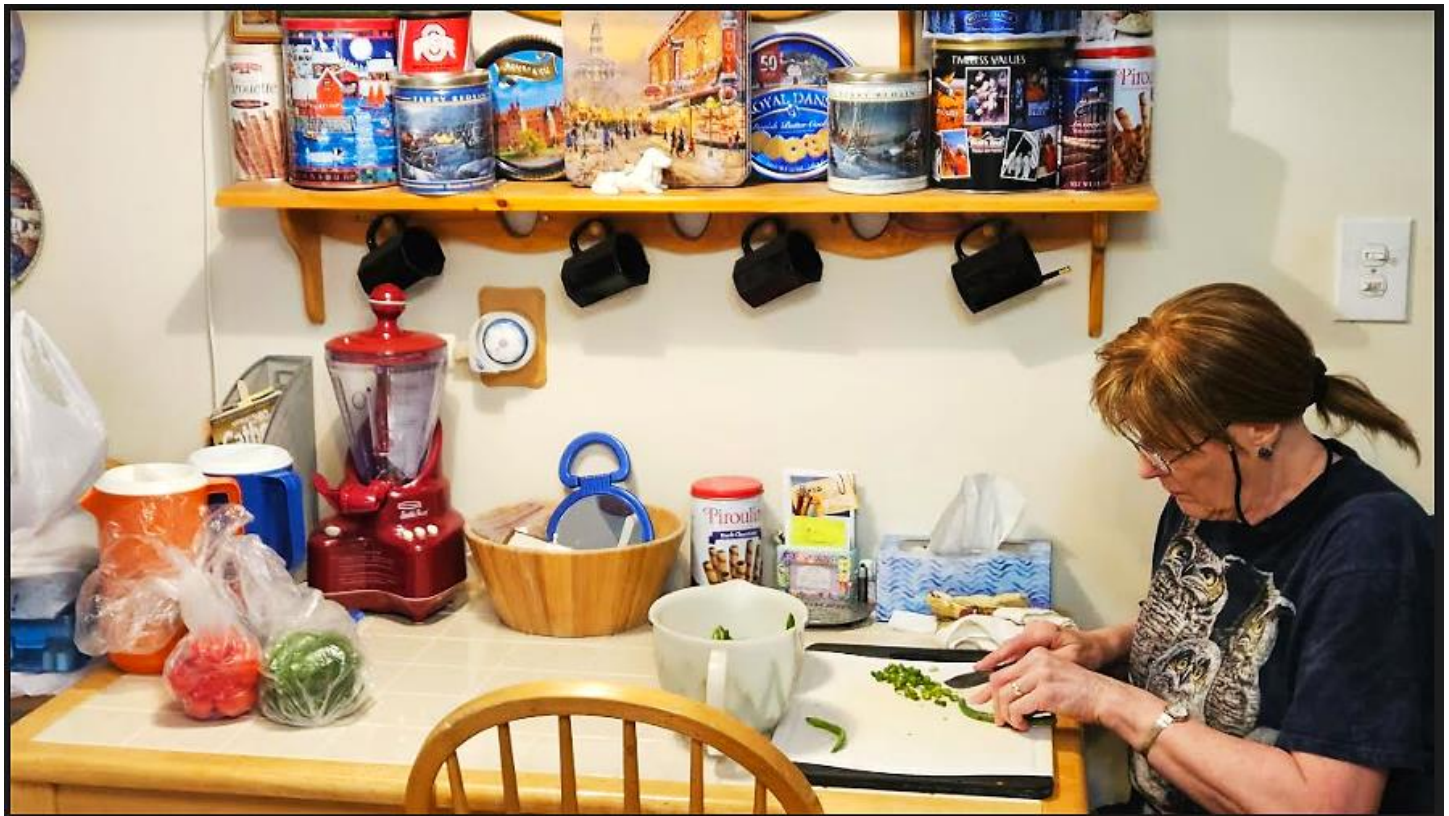
Today we are making Beef Stew, Chicken Stew, and Bean Salad!