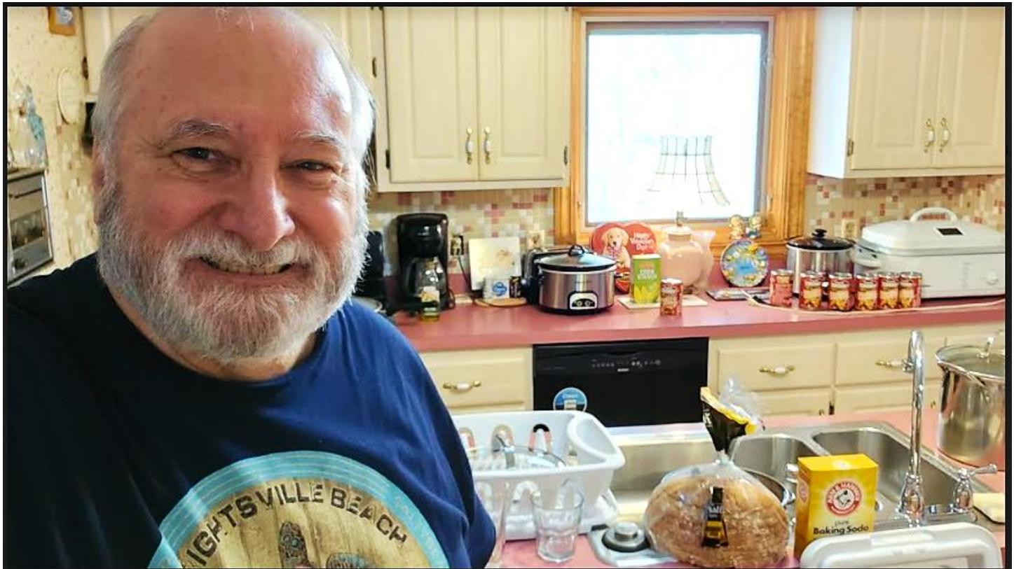
Today we are making Beef Stew, Chicken Stew, and Bean Salad!