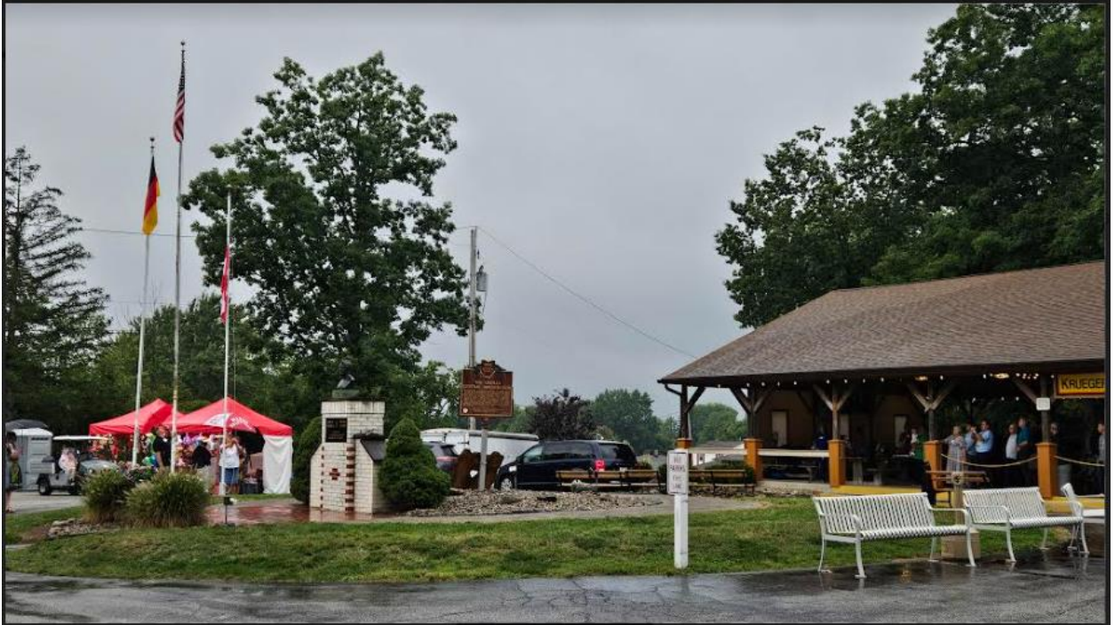
Flag Raising Ceremony: American Flag, German Flag, and Austrian Flag all with National Anthems