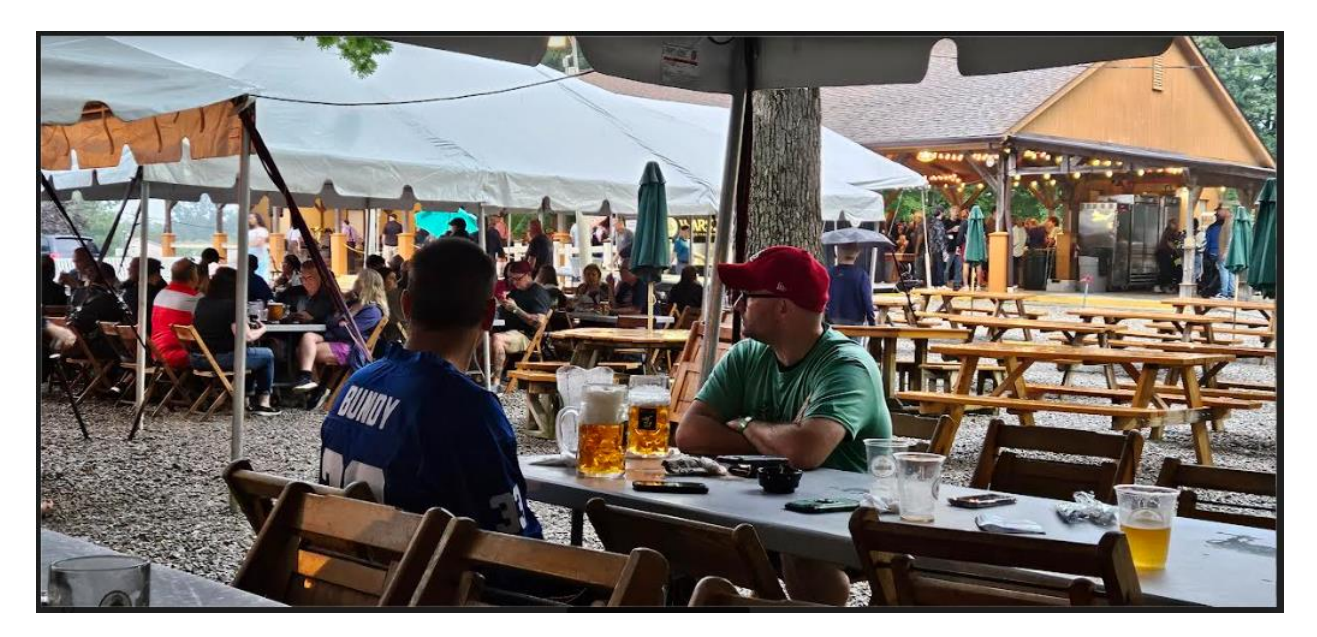
As the Bier poured so did the rain, all day with some times harder than others...