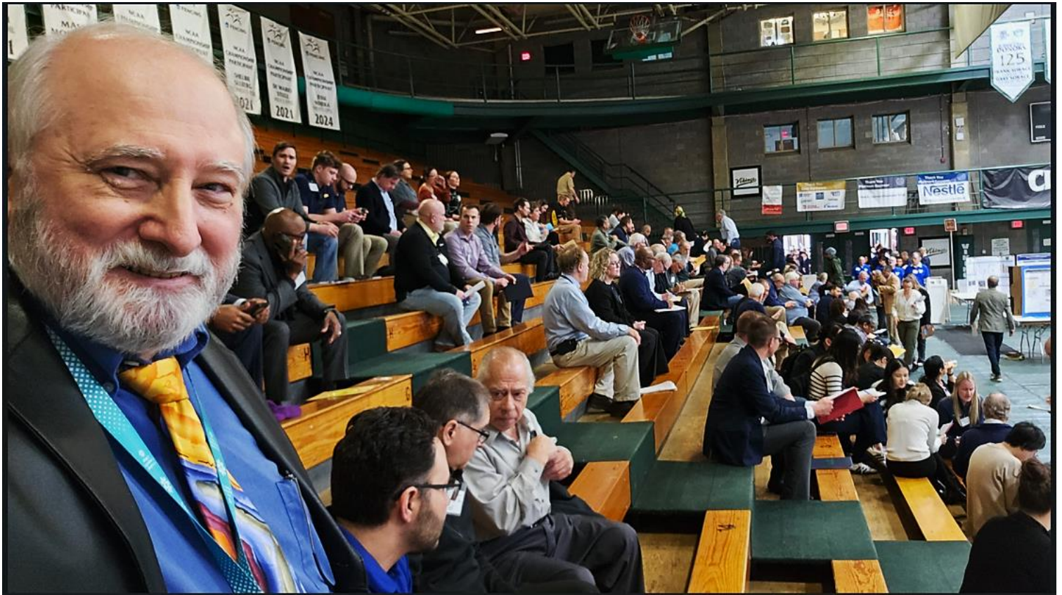
All the CLE AIChE four Judges