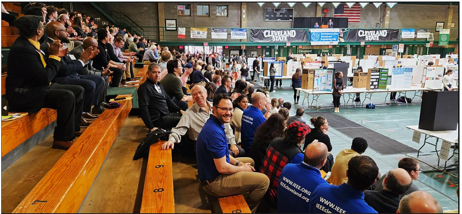
The CLE AIChE three of four Judges