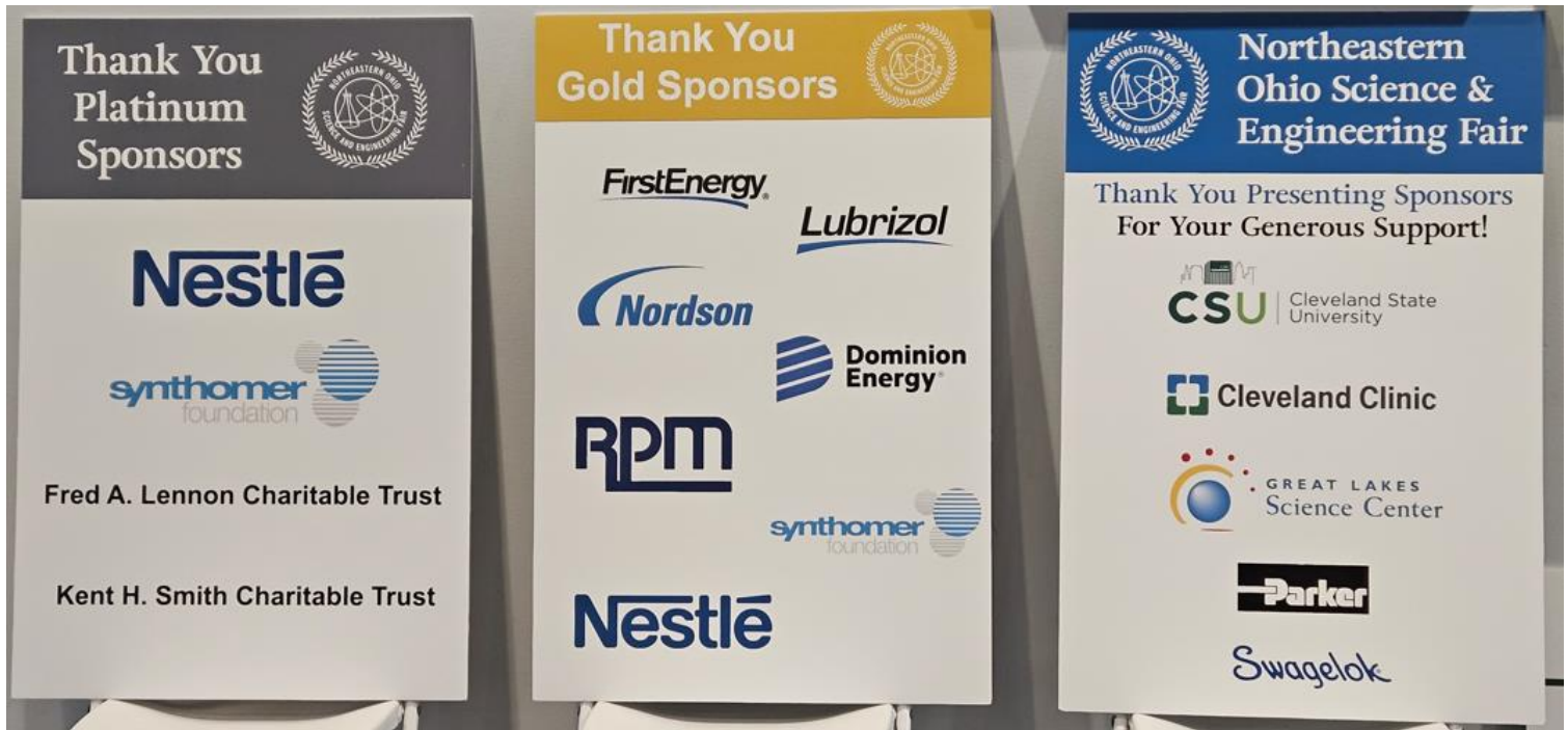
NEOSEF Event 2025 Sponsors at CSU