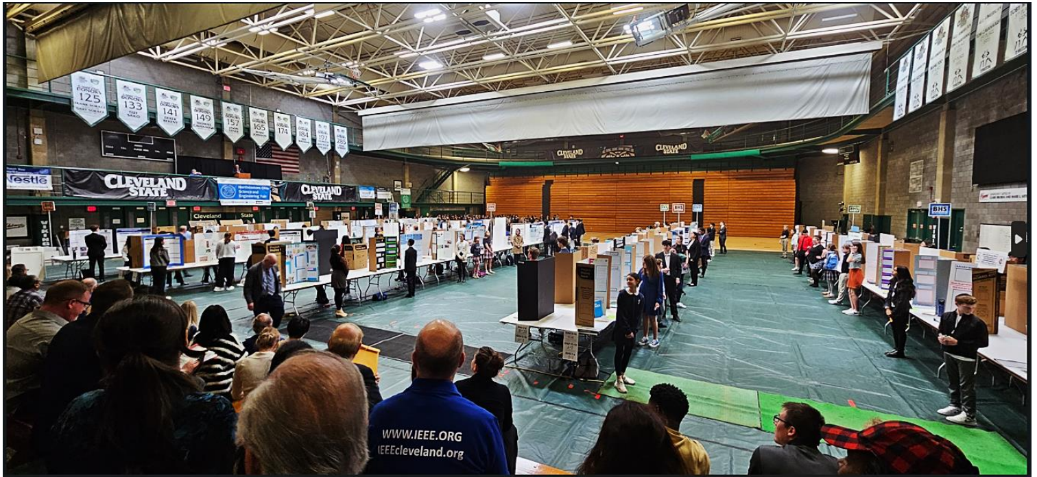
Greetings and Welcome of Student Scientists (~300) by Judges (~300) in the Physical Education Building Gym on the main floor