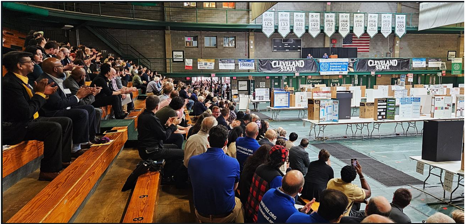
Greetings and Welcome of Student Scientists (~300) by Judges (~300) in the Physical Education Building Gym on the main floor