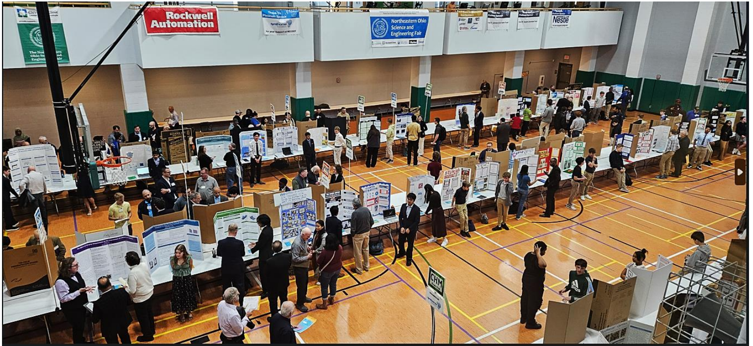
The Judging Begins with the Student Scientists in the Physical Education Building Gym Basement