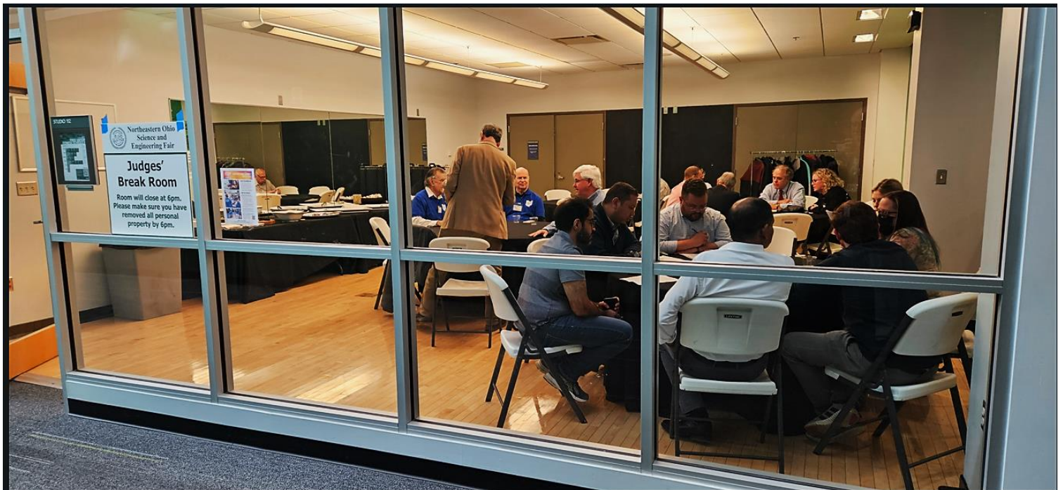
Judges (~300) Score the Student Scientists (~300) Based on their Subject Matter, Scientific Method, and Presentation for their awards