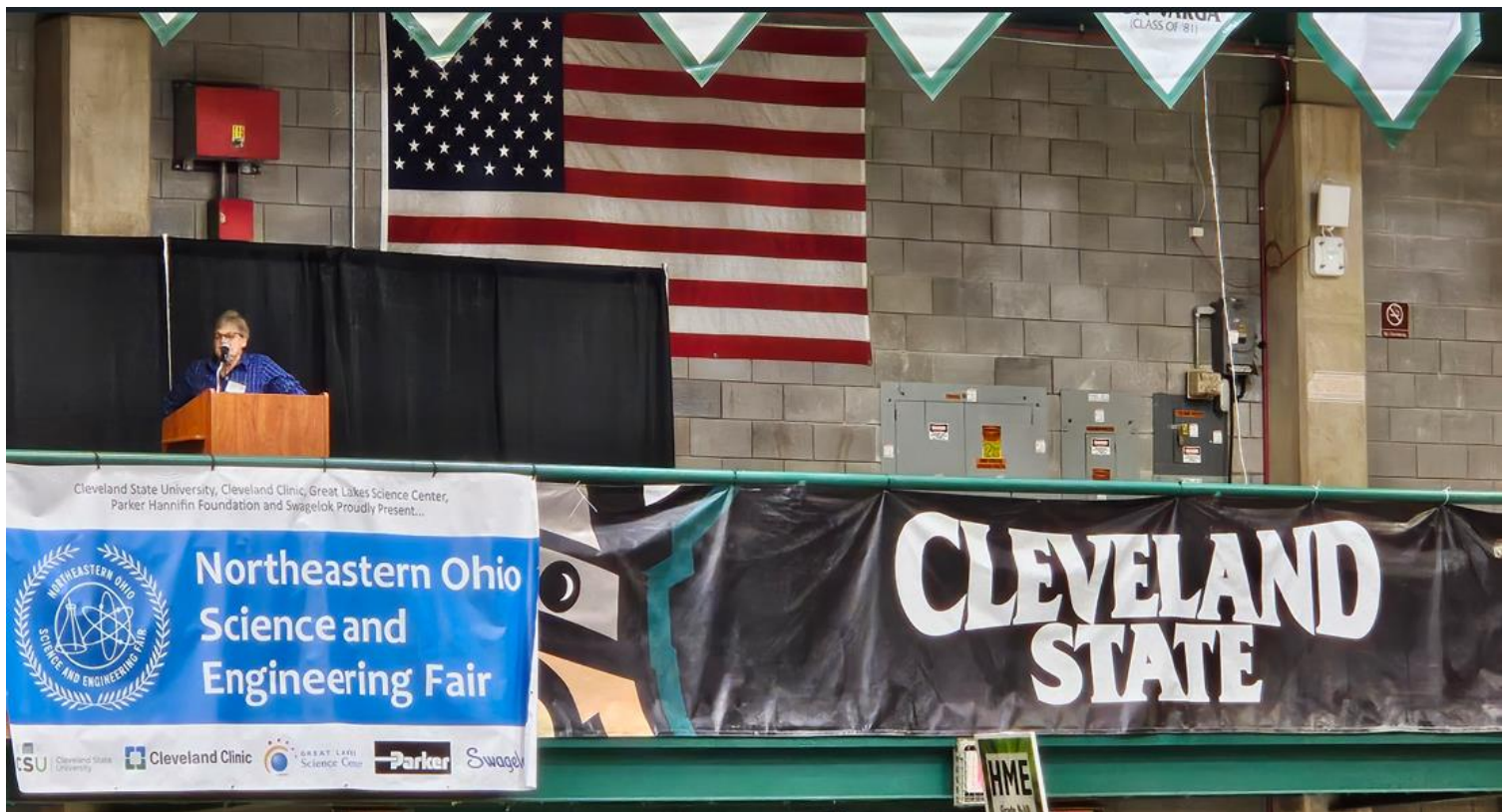
Greeting and Welcome to Judges by NEOSEF Chair followed by the Rules and Recommendations