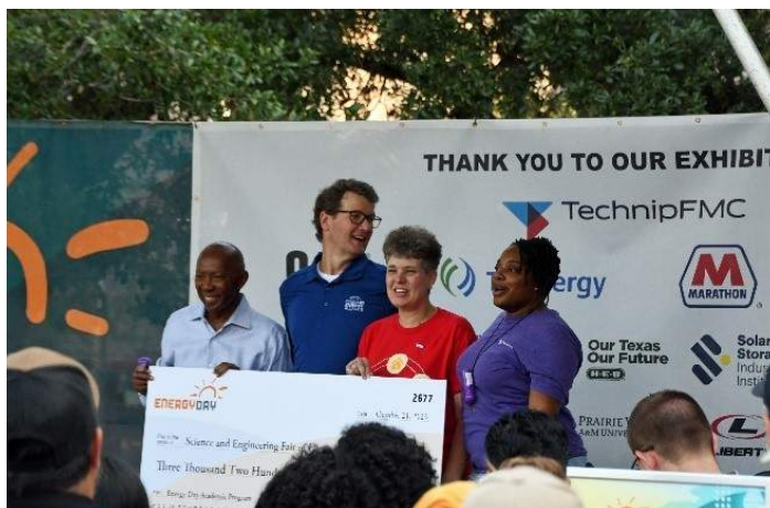
Snippets of Energy Day event held on October 21.