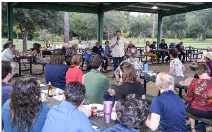
Some snippets of STS Members Enjoying the Gathering for the 80th Anniversary Celebration.