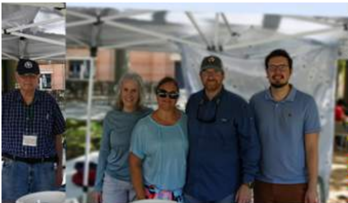
Snippets of the workflow created by students and gathering as part of the 2023 Reach for the Stars STEM Festival. Some of