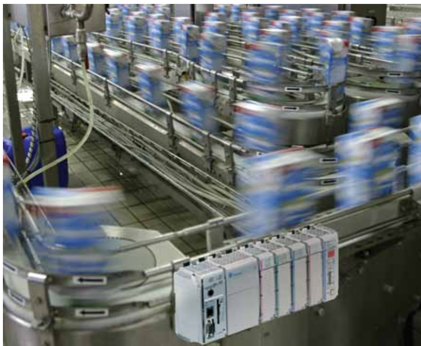
▲ Figure 1. Advanced automation and control is at the heart of smart manufacturing. This multi-purpose system synchronizes and monitors processes in a bottling plant.

The goal of the smart manufacturing movement is to create knowledge-embedded manufacturing operations. Today's operations will be transformed from reactive to proactive, response to prevention, compli-