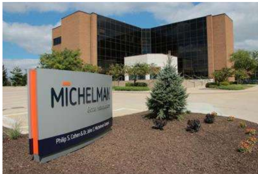
Michelman Headquarters Cincinnati, OH